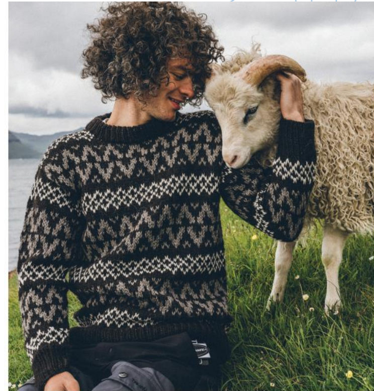
Figure 1: Sheep and islanders, Faroe Islands, 2020.